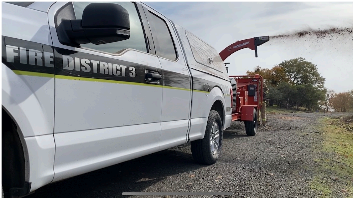
Jackson County Fire District 3's Community Wood Chipper chipping wildland fuel off the side of the road.