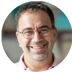
Daron Acemoglu Massachusetts Institute of Technology

In summer 2024, we welcomed 35 talented researchers to the J-PAL network. We will feature a few of them here each month.