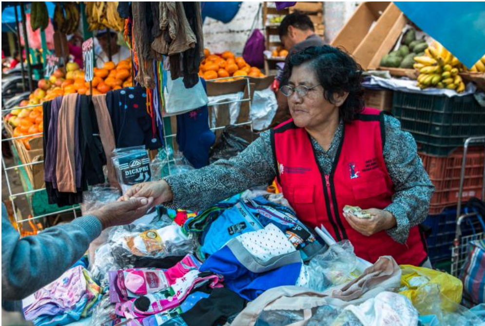
A female worker is selling clothes and earning cash.

Providing greater access to financial resources has shown mixed effects on women's exposure to intimate partner violence. In some instances, increasing women's income reduced violence by decreasing households' financial stress and improving women's bargaining power, while in others violence increased, possibly because conflicts arose on how to use resources or because men decided to use violence to assert their dominance in the household.