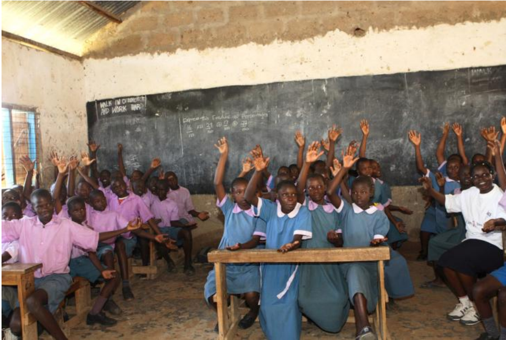
A classroom in Kenya.

Programs that reduce the costs of education increase student enrollment and attendance. However, there is considerable variation in the cost effectiveness of different programs.