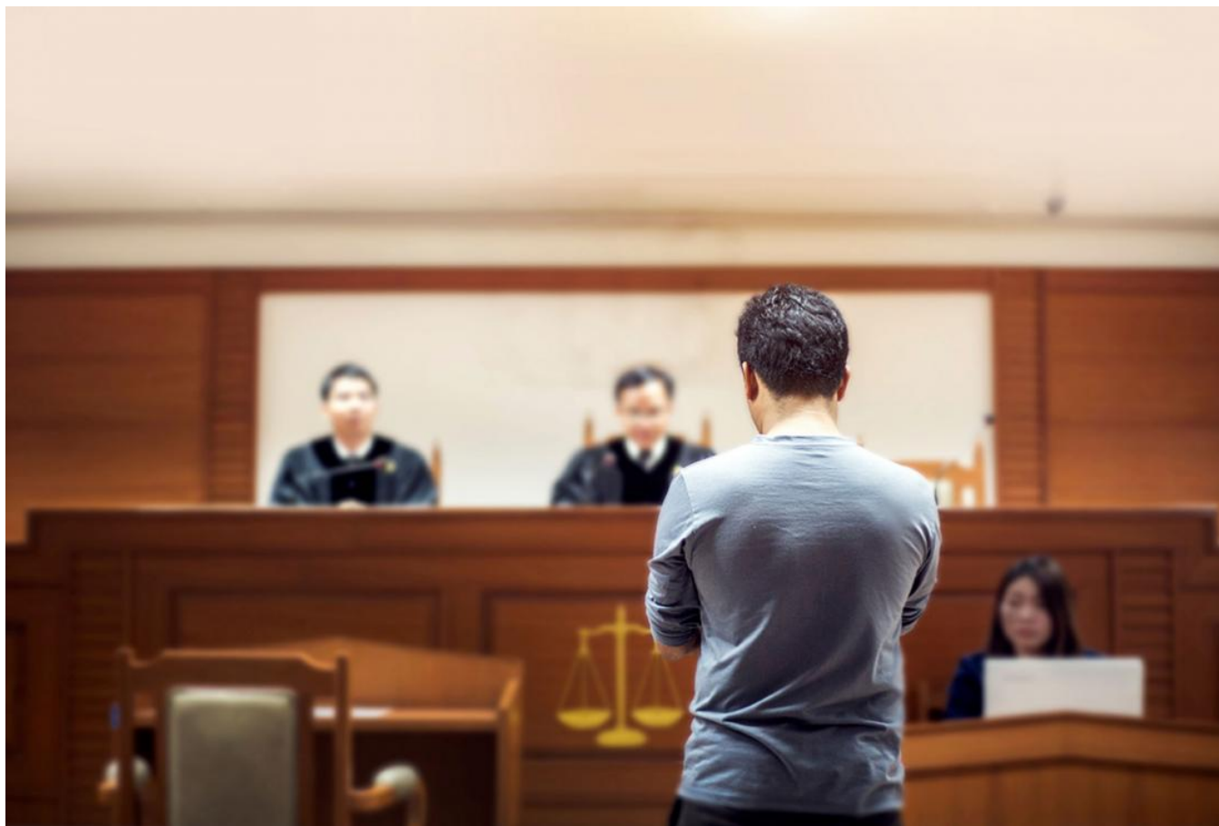
Man stands before judge in a courtroom.

Behaviorally informed alterations to the summons form and pre/post court date text messages were rolled out to individuals who received summonses in NYC starting in March 2016. Anyone in New York City receiving a summons is given the option to provide their cell phone number to police, and approximately 13 percent do. Roughly 20,000 summons recipients who provided a cell phone number between March 2016 and June 2016 were included in a randomized evaluation to test the effect of text messages on FTA.