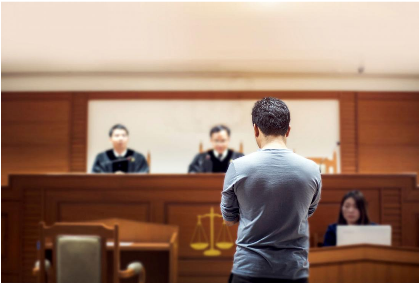
Man stands before judge in a courtroom.

Behaviorally informed alterations to the summons form and pre/post court date text messages were rolled out to individuals who received summonses in NYC starting in March 2016. Anyone in New York City receiving a summons is given the option to provide their cell phone number to police, and approximately 13 percent do. Roughly 20,000 summons recipients who provided a cell phone number between March 2016 and June 2016 were included in a randomized evaluation to test the effect of text messages on FTA.