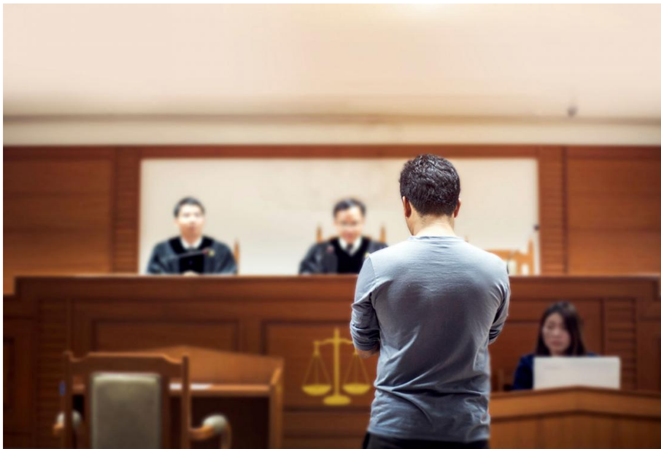
Man stands before judge in a courtroom.

Behaviorally informed alterations to the summons form and pre/post court date text messages were rolled out to individuals who received summonses in NYC starting in March 2016. Anyone in New York City receiving a summons is given the option to provide their cell phone number to police, and approximately 13 percent do. Roughly 20,000 summons recipients who provided a cell phone number between March 2016 and June 2016 were included in a randomized evaluation to test the effect of text messages on FTA.