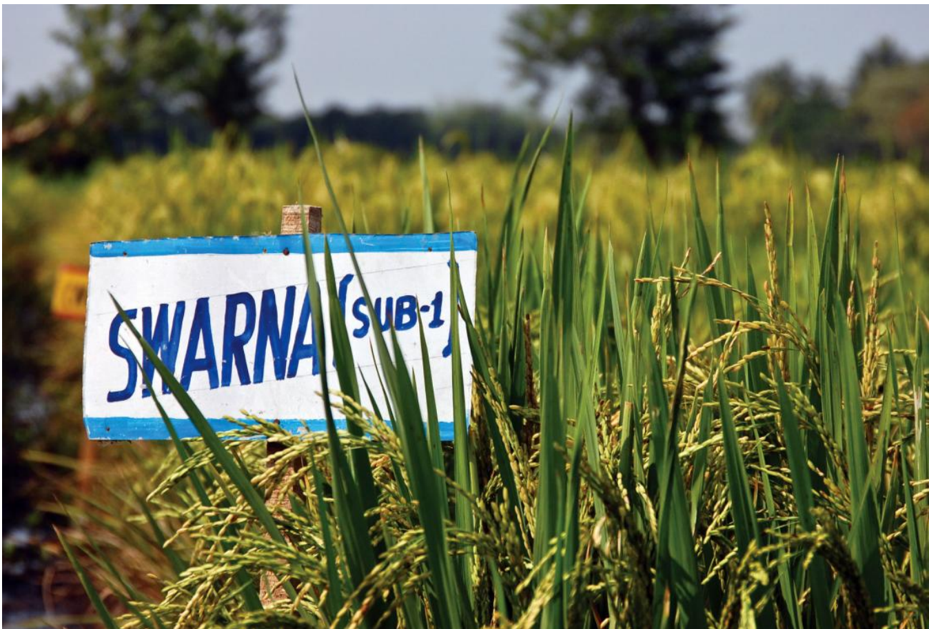
A field of Swarna Sub1 rice growing in India.

This project evaluates the impact of introducing the Swarna-Sub1 rice variety in the Indian state of Odisha. In this region, rice is a staple food and risk of flooding is high. Low levels of fertilizer use are characteristic of flood-prone areas of India.