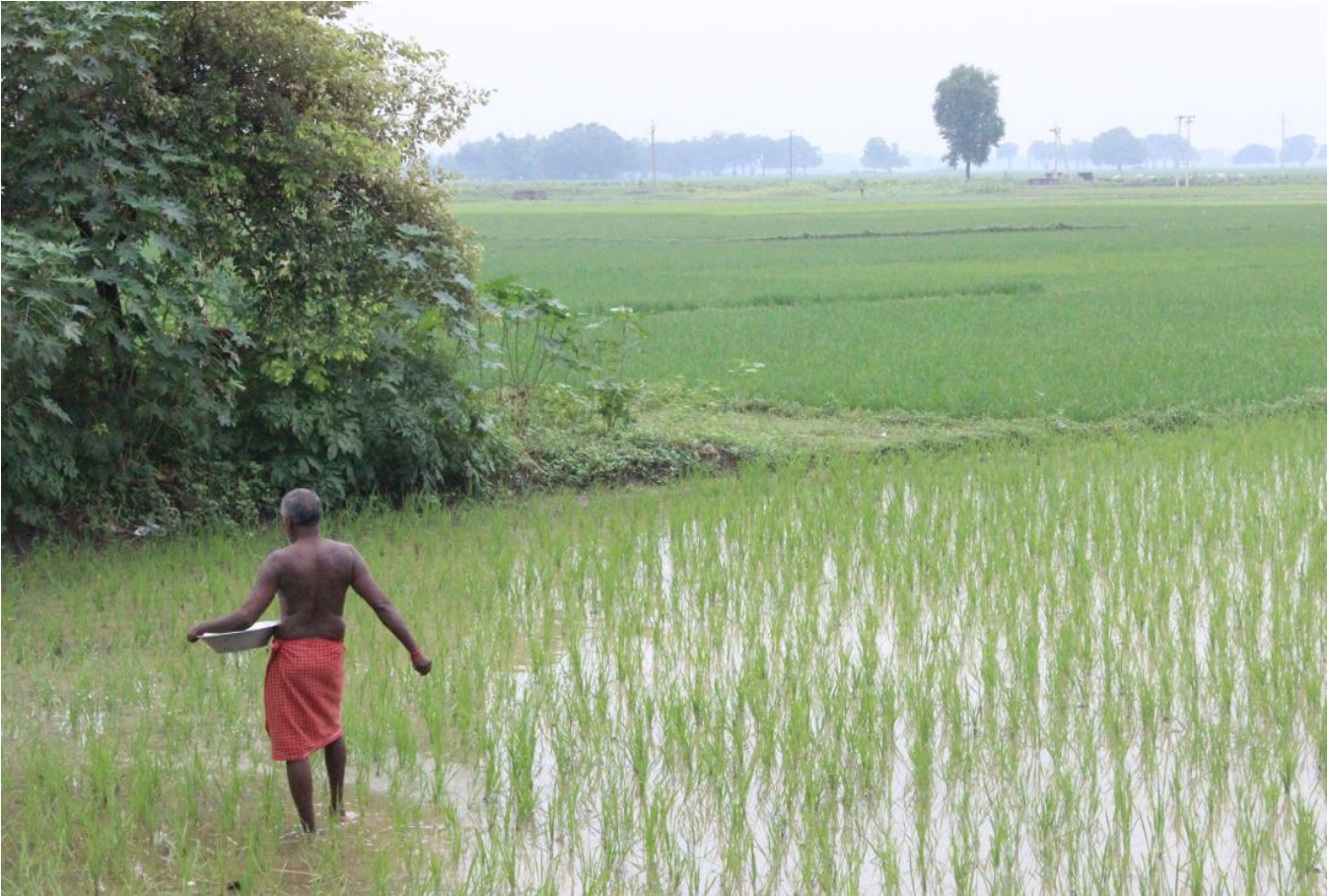
Farmer in rice field in India.