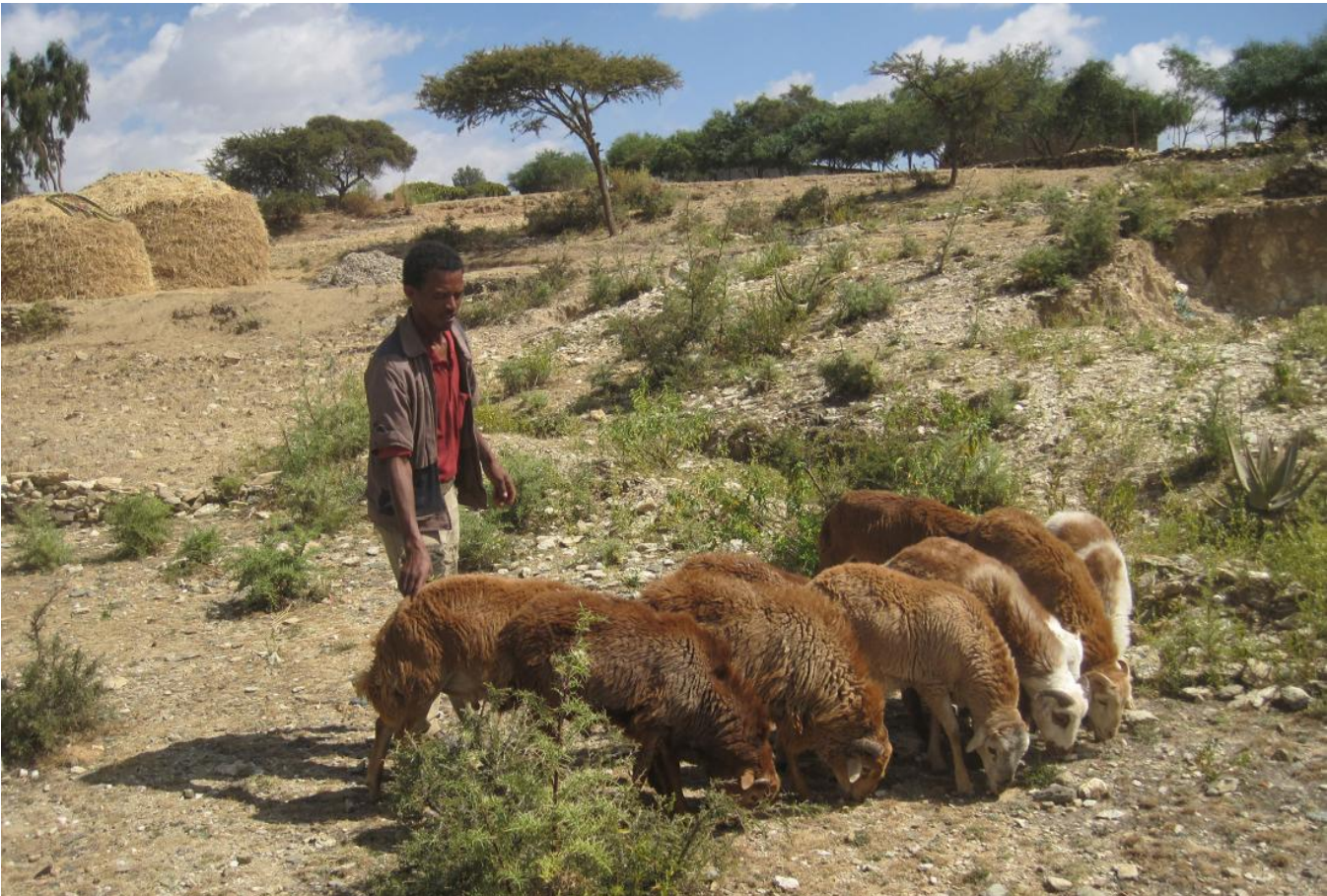
Beneficiary of graduation program herds sheep in Ethiopia

loans and with at least one member capable of work. A local food security task force narrowed eligibility further by choosing those they considered to be the poorest members of their community. Within the sample, the median total per capita consumption was 2014 PPP US$1.22 per day, with two-thirds of households consuming less than US$1.25 per day. Two-thirds of households reported that not everyone in the household got enough food.