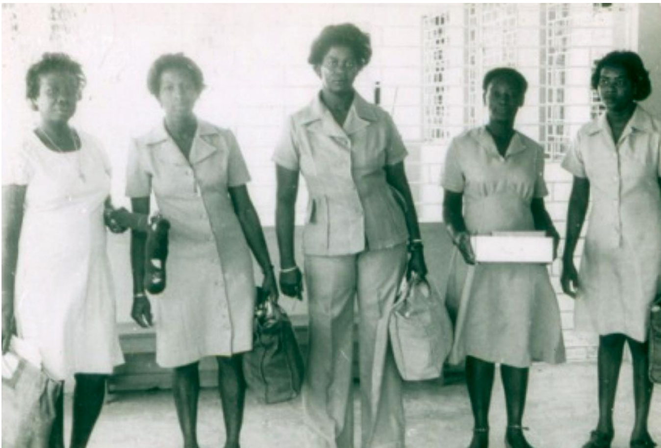
Original photograph of community health aides in Jamaica preparing for their weekly home visits

In 2007 and 2008, researchers conducted a follow-up evaluation of an early childhood intervention that took place in 1986-87 in low-income neighborhoods in Kingston, Jamaica. Among the children in the study in 1986, only 5 percent had mothers with more than an eighth grade education, and fathers were present in less than half of the households. About one-fifth of the children were born with low birth-weight.