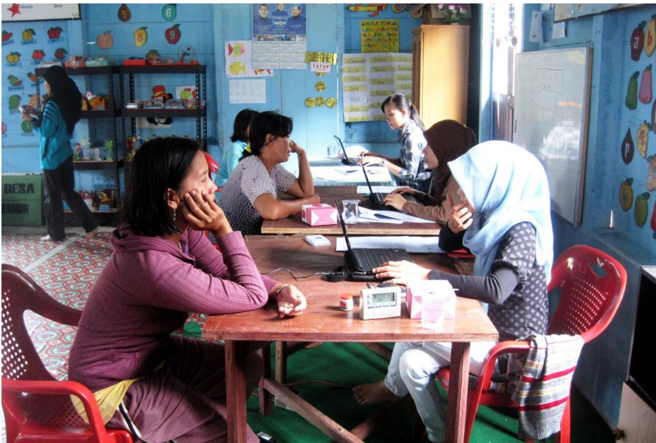
A program applicant taking a proxy means test

Indonesia's Program Keluarga Harapan (PKH) aims to provide conditional cash transfers to the country's poorest households. PKH beneficiaries receive between IDR 600,000 (US$67) and IDR 2.2 million (US$247) annually depending on family composition for up to six years. Households must meet certain requirements, including sending their children to school, attending pre- and post-natal check-ups, and completing vaccinations for children, to receive the quarterly transfer. To be eligible for PKH, a household must include a pregnant woman, a child under five, or children under 18 with less than nine years of schooling, and its per capita consumption must be less than 80 percent of their local district's poverty line. Because consumption is not easy to observe, the Indonesian Government administers a proxy means test (PMT) to estimate it.