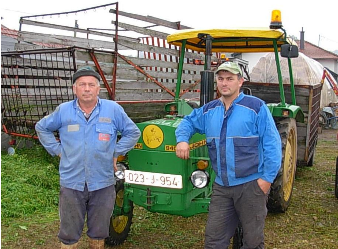
Microloan borrowers with their tractor in Bosnia and Herzegovina

Bosnia and Herzegovina has an active microcredit market, but poorer segments of the population have typically not been served by MFIs. Prior to this study, the microfinance applicants who participated earned an average annual income of about US$11,100. On average, around 40 percent of their annual income came from self-employment. Nearly one third of the applicants had only completed primary school, while 5 percent had attended university. The study took place at the height of the global financial crisis of 2008 and 2009, which strongly affected Bosnia and Herzegovina. During the study, many MFIs experienced dramatic increases in late and non-repayment.