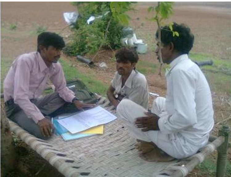
Discussing rainfall insurance in India

About 90 percent of variation in crop production levels in India is caused by variation in rainfall levels and patterns. While 90 percent of the Indian population is not covered by any formal insurance, informal risk-sharing arrangements between members of the same sub-caste are common. In India, sub-caste or jati is a centuries-old institution that has been shown to play an important role in risk sharing and business transactions.