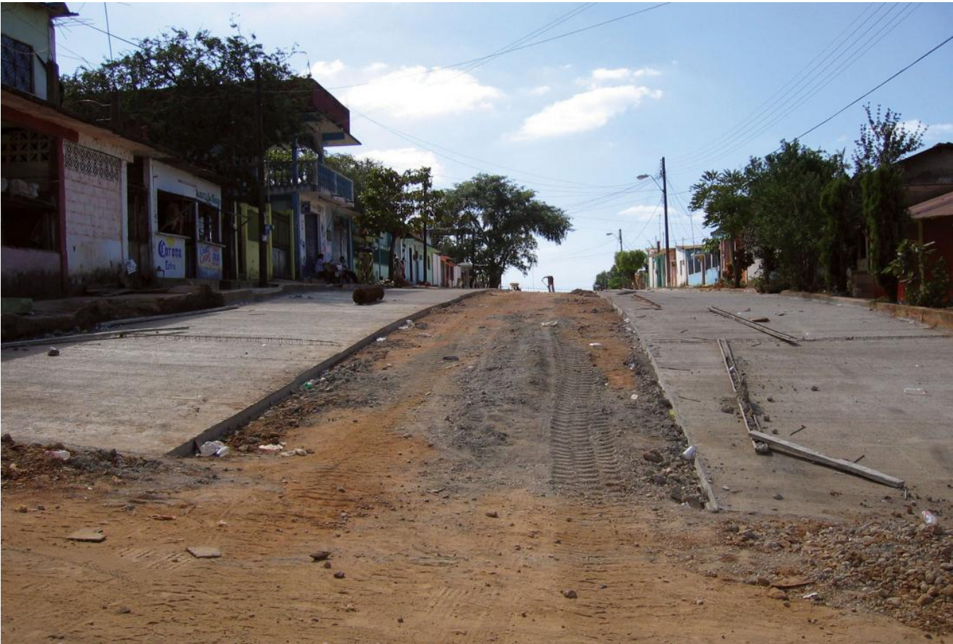
Road being paved in Acayucan, Mexico

income neighborhoods lie in the outskirts of the city and the local government has paved streets in these neighborhoods a few sections at a time. In Mexico, municipal governments are responsible for most elements of their urban infrastructure, but the municipal budget is primarily funded by federal taxes, with less than 10 percent derived from local taxes (consisting of the property tax and business-permit fees).