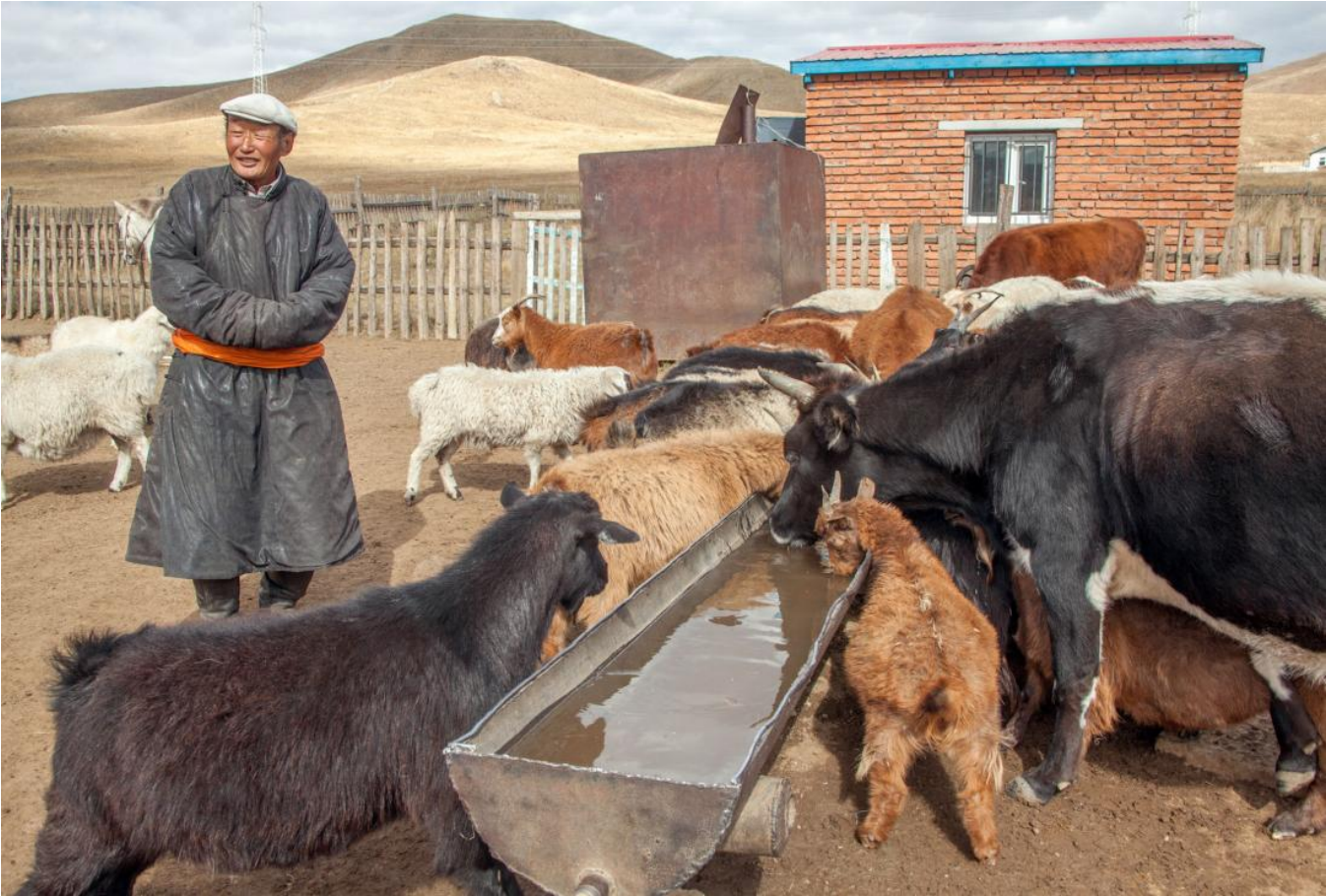
Herder and livestock, Mongolia.

richer, male, and urban Mongolians. MFIs are therefore looking for more cost-efficient ways to serve poor, rural borrowers. Mongolian microcredit has traditionally been provided in the form of individual loans. In the past, many MFIs assumed that nomadic indigenous Mongolians would not take up group loans because they had small social networks outside their extended families. But in recent years, informal collective self-help groups have developed in rural areas across the country and have begun to offer loans to their members, suggesting that group lending may be feasible in Mongolia.