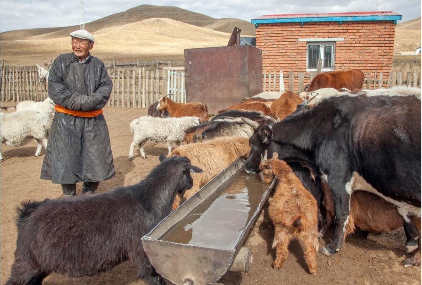
Herder and livestock, Mongolia.

richer, male, and urban Mongolians. MFIs are therefore looking for more cost-efficient ways to serve poor, rural borrowers. Mongolian microcredit has traditionally been provided in the form of individual loans. In the past, many MFIs assumed that nomadic indigenous Mongolians would not take up group loans because they had small social networks outside their extended families. But in recent years, informal collective self-help groups have developed in rural areas across the country and have begun to offer loans to their members, suggesting that group lending may be feasible in Mongolia.