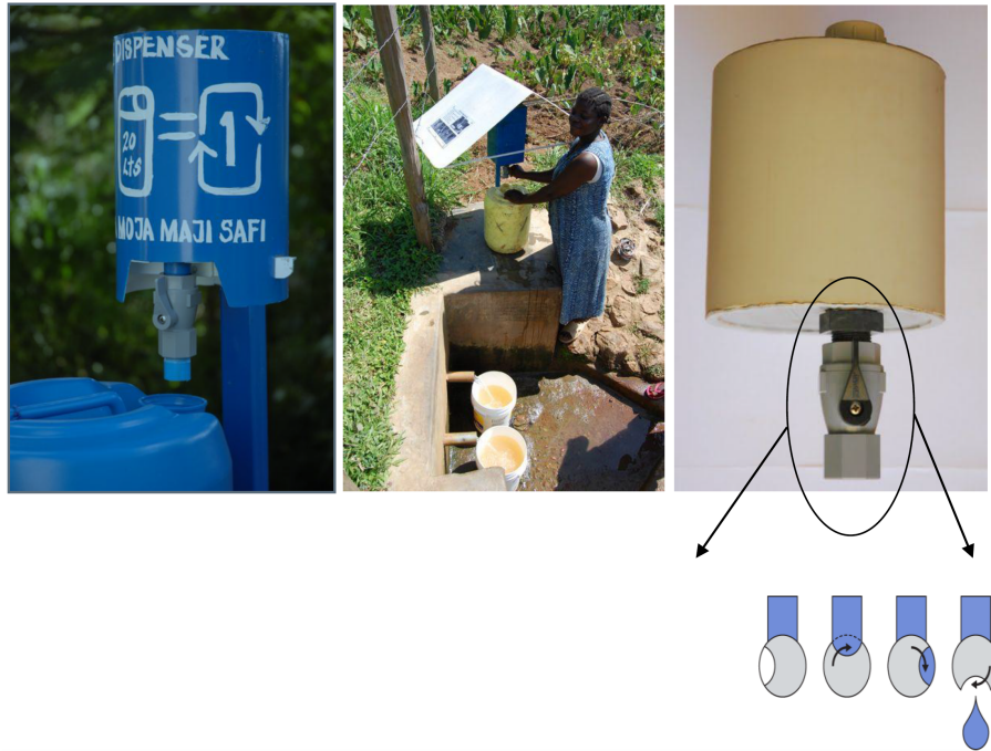
Figure 1: The Chlorine Dispenser