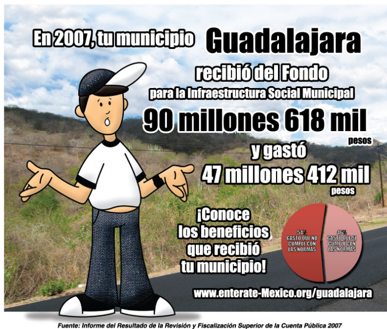
Figure 1: Example of “Corruption Information” flyer

Notes: The flyer was folded in half. The upper image is the front and back of the flyer, the lower image is the inside of the flyer. This figure shows the “Corruption information” flyer. The “Budget Information” and the “Poverty expenditure” flyers are identical to the flyer shown here except for the graph, which includes the relevant information for each treatment group. Figure 2 includes examples of the flyers in both placebo groups.