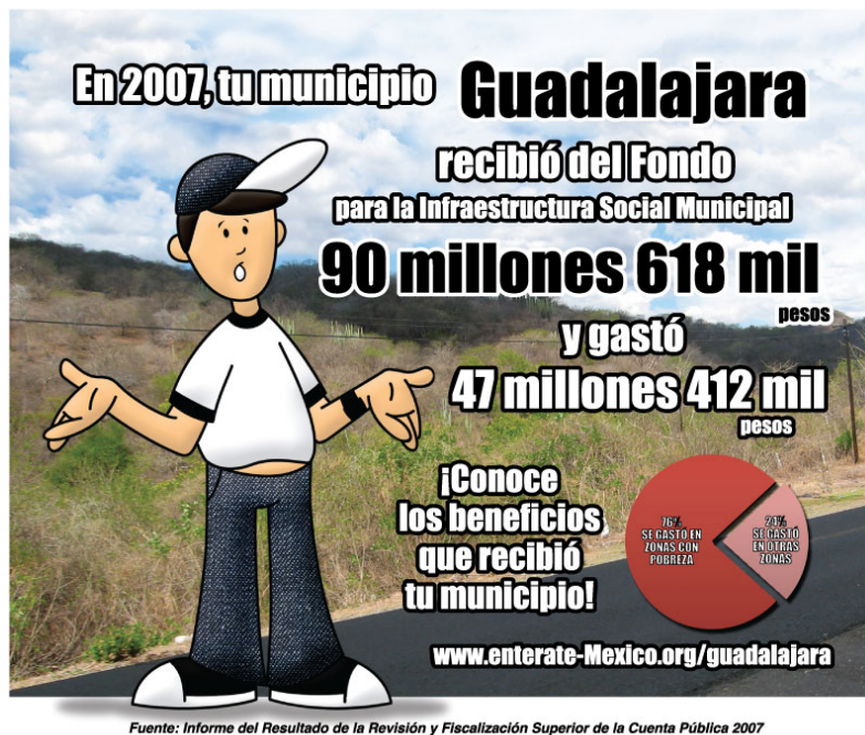
Figure 2: Example of flyers for the two placebo groups

Notes: The flyer was folded in half. The front of the flyer is the same as the upper image in Figure 1 for all flyers. In the “Budget Information” group the inside of the flyer was as shown in the upper image in this figure. In the “Poverty expenditure” group the inside of the flyer was as shown in the lower image.